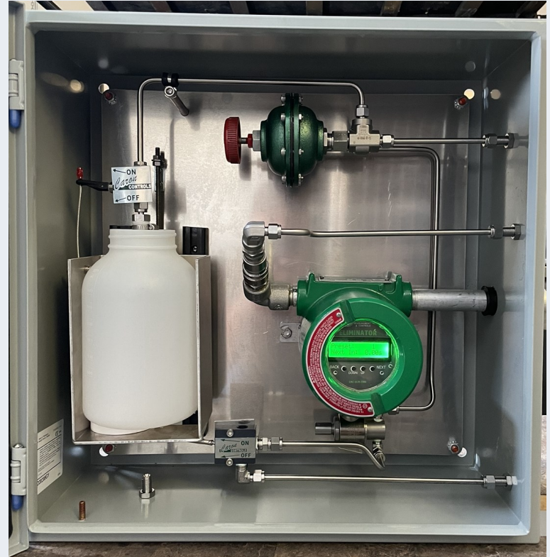
Controller Technical Information